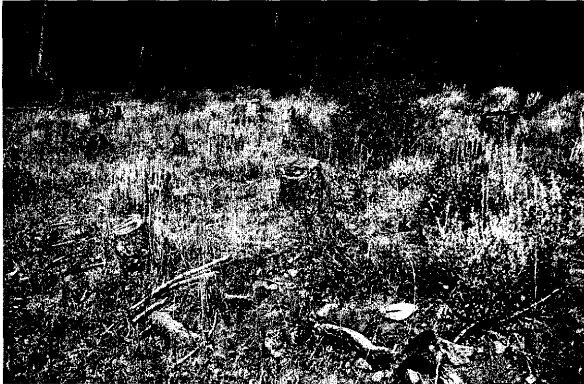
HIGHGRADING ILLUSTRATED. Mature Douglas Fir taken under guise of mistletoe control project in Idaho's Salmon District.

Eastern Idaho districts had a large number of contract defaults and fraud occurrences. The timber sale folders PEER reviewed were rife with evidence of default, fraudulent bonds, breach of contract, and contest of volume and payment requirements. For example, the Red Rocks sale was supposed to have been a