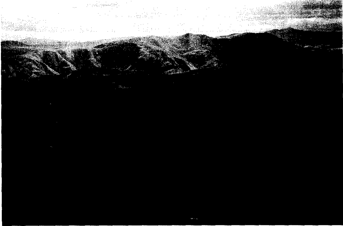
BLM PUBLIC DOMAIN. Typical BLM Public Domain lands in eastern Oregon en route to Lookout Mountain.