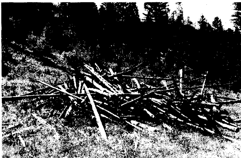
CALLING CARD. Large pile of logging debris and useable wood left after BLM sale in southeastern Idaho. BLM cannot afford to go back and burn the piles and there is no access for private woodcutters.

met. The dead volume was later resold for "fuelwood" at very low fuelwood rates, though even then the purchaser cut only trees easily reached from the road. He then proceeded to resell the logs for houselogs at very high retail prices. The agency and the taxpayer received only the fuelwood stumpage rates.