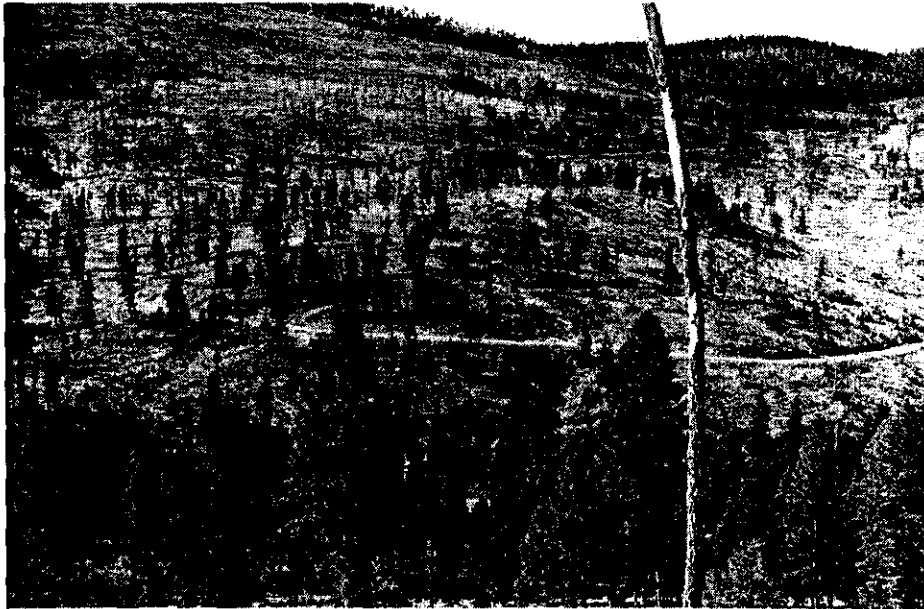
CHECKERBOARD LANDS. BLM lands in foreground abut private timber tracts with more BLM acreage in background.

Criticism of the agency's timber program has resulted in inadequate and generally belated hiring of additional foresters on some units, but not before poor sale design, shoddy sale administration, ineffective post-sale silvicultural treatments required the correction. Even in these limited