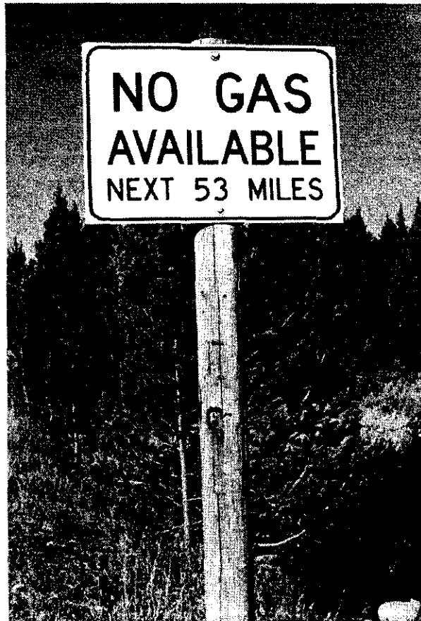
LONG HAUL. It is a long way between BLM timber sale sites. Sign is on the Yale-Kilgore road in southeastern Idaho.

By contrast with private land exchanges, BLM public agency consolidations are infrequent and glacially slow. Consolidation plans have been complete for more than a decade, but attempts at implementation have failed. The proposed consolidations would have eliminated much duplication of effort, time and expense. BLM foresters must thus continue to work many hundreds of extra hours and unnecessarily drive many thousands of extra miles, exacerbating the staffing and funding problems the agency faces every year.