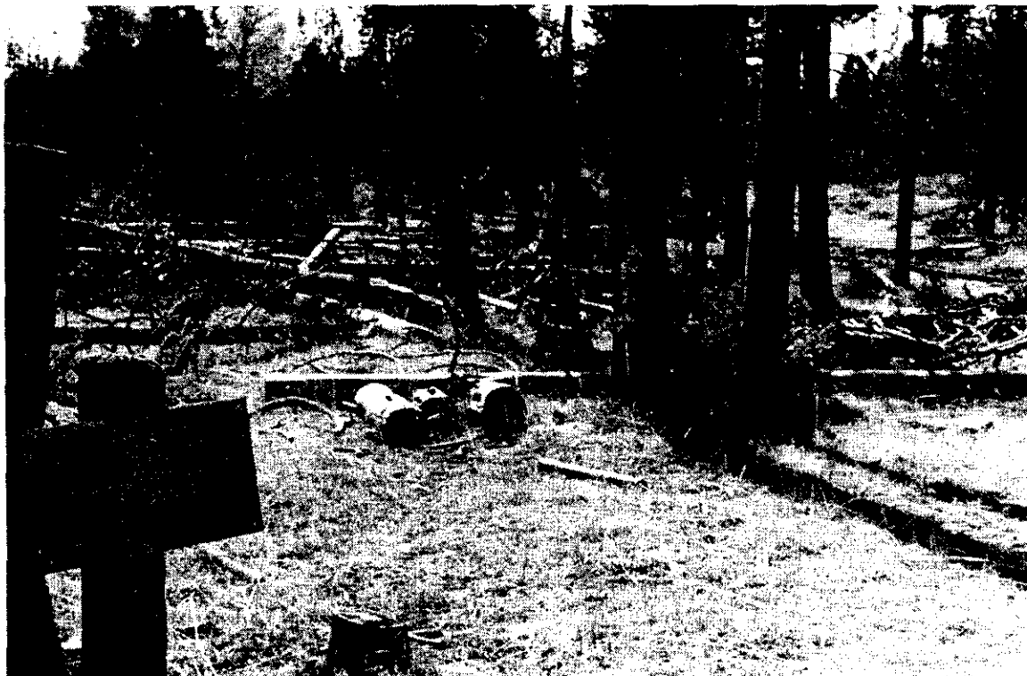
ROBBING THE RESERVE. BLM sign in southeast Idaho reads: "Boundary of Timber Reserve - No Cutting Authorized Beyond This Point." BLM has no records indicating who cut the trees within the reserve.

within a delineated area, even if it exceeds the volume estimated or sold, to be cut without additional payment. Several sales reviewed by PEER in southern Idaho yielded the same pattern found elsewhere—the volume actually cut appeared to be several times the amount sold.