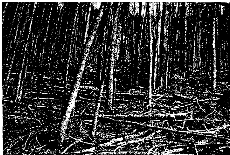
UNCLEAR ON THE CONCEPT. Logging debris and slash left on BLM sale site defeat the purpose of reducing fuel buildup for fire prevention.

One principal result of this failure is waste at the taxpayer's expense. In eastern Idaho's North Leigh Creek sale, for example, large volumes of usable wood were left in decks and piles on the site. The Big Canyon sale on Idaho's Burley District, originally justified on grounds of timber salvage and necessary reduction of fire hazard, did not require the purchaser to remove the standing dead timber, the very reason for the sale in the first place. This ensured that neither the salvage nor the fuel-reduction objectives would be