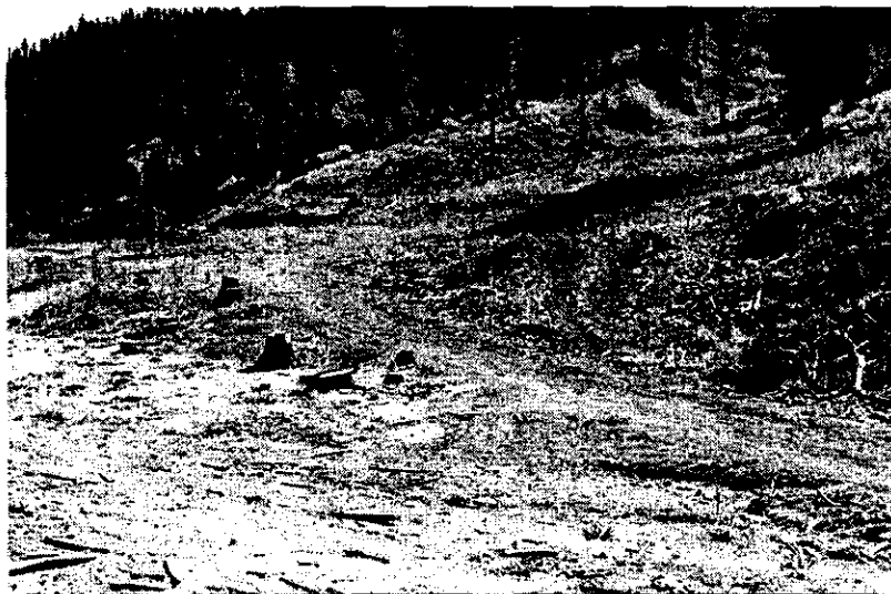
BAD DEAL. Livestock trampling and off-road-vehicle use has devastated much of this negotiated sale area in Idaho's Blackfoot Mountains.

Without public notice, negotiated sales are often completed and cut before the public becomes aware of them. This stealth quality of negotiated sales is precisely why there are supposed to be strict size limits.