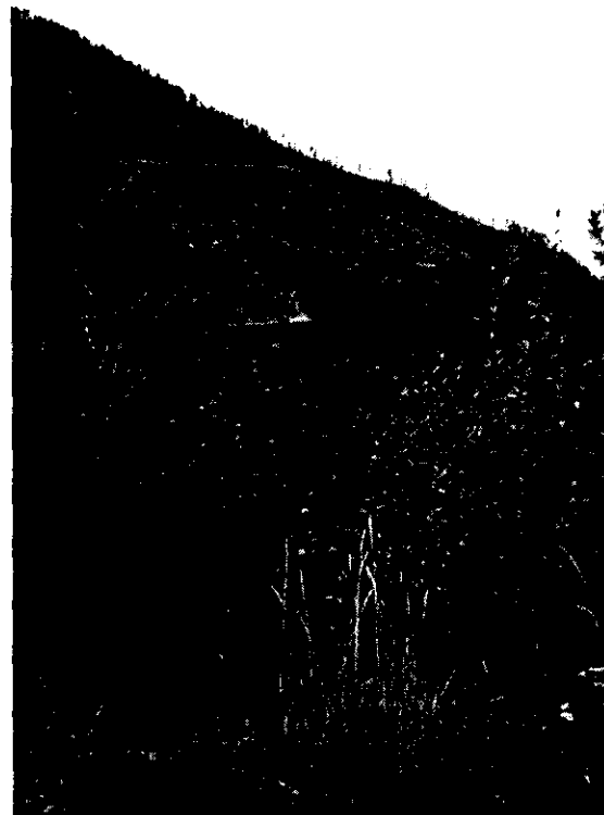
SLIPPERY SLOPE. Clearcut inclines on BLM lands will never regrow

While few silviculturists prescribe clearcutting south- and west-facing slopes at these latitudes, the Bradley Mountain, Moonlite Mine and Wolverine Canyon sales in Idaho demonstrate