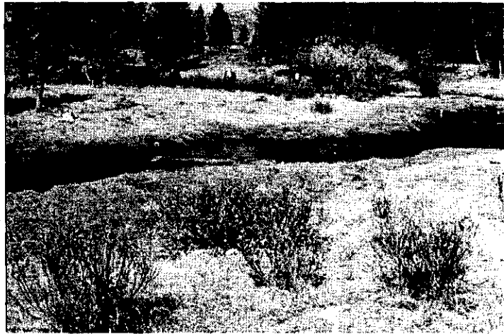
MOOOVE OVER. Native vegetation has been replaced by bluegrass sod due to heavy grazing of this Garnet District, Montana, timber site.

planted tree seedlings is poor, at best. Failures are much more common than successes, with two and three expensive replantings often necessary. Very frequently, cut over timber stands revert to long-term brushfields that cannot be