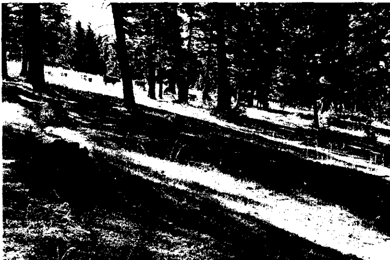
COWS CAN'T FISH. Cows congregate in riparian areas, trampling stream banks and destroying fish habitat in southeastern Idaho.

BLM requires successful reforestation within five years. Because much of the agency's land is at hot and dry low elevations, survival of