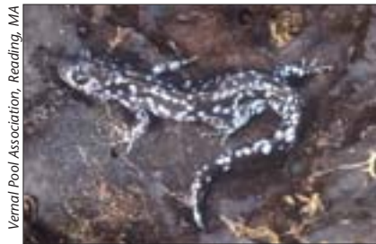
Vernal Pool Association, Reading, MA

The right-of-way under consideration is home to an astonishing diversity of rare species: spotted turtles lay their eggs in the dirt path, and blue-spotted salamanders and four-toed salamanders migrate across the right-of-way to use the many vernal pools adjacent to the abandoned rail bed.