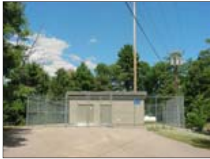
DIRTY WATER: Wells in Easton are threatened by the Stoughton Alternative

nants from construction and operation of the proposed New Bedford/Fall River rail line will contaminate