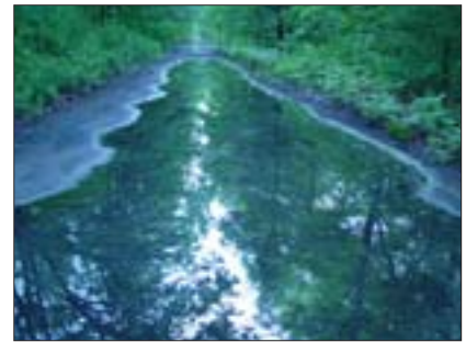
TRAILS TO RAILS: MBTA's right of way through the pristine swamp.

MBTA's proposed alternative would run a new line through 3.2 miles of the Hockomock, effectively bisecting it and fragmenting the surrounding forest. The